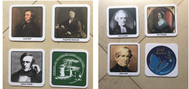
Apologies for inept photography